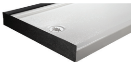
Factory-installed tile flange is 1/16" thick. Account for this thickness when planning final opening size.