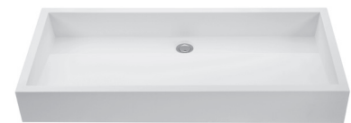
Shown right with drain cover removed.

Fixed Drain Without Overflow Chrome (DKFDC) $325