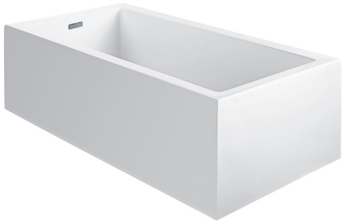
Available as a freestanding model or finished on 1, 2 or 3 sides for various installation applications.