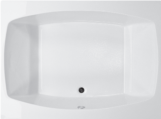
Features a textured bottom