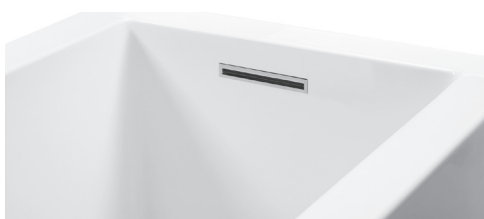
Optional Slim-Line overflow