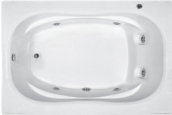
Hartwell features a textured bottom.