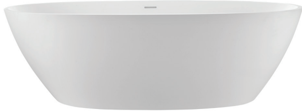
Shown above as soaking bath without pedestal