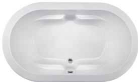
Shown with optional integral armrests