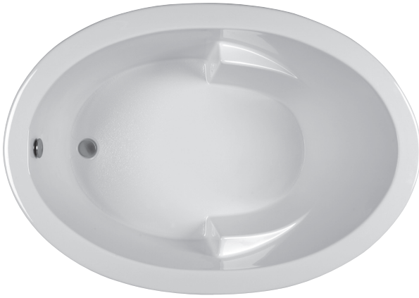
Features integral armrests. Shown with optional textured bottom.