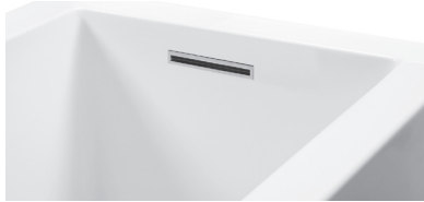
Optional Slim-Line overflow