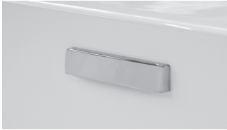
Rectangular overflow included

Slim-Line Overflow with Toe Tap Drain Solid Brass Drain • Chrome (SLOTSBC) $1,025 • Brushed Nickel (SLOTSBBN) $1,030 • Polished Nickel (SLOTSBPN) $1,030 • White (SLOTSBW) $1,065